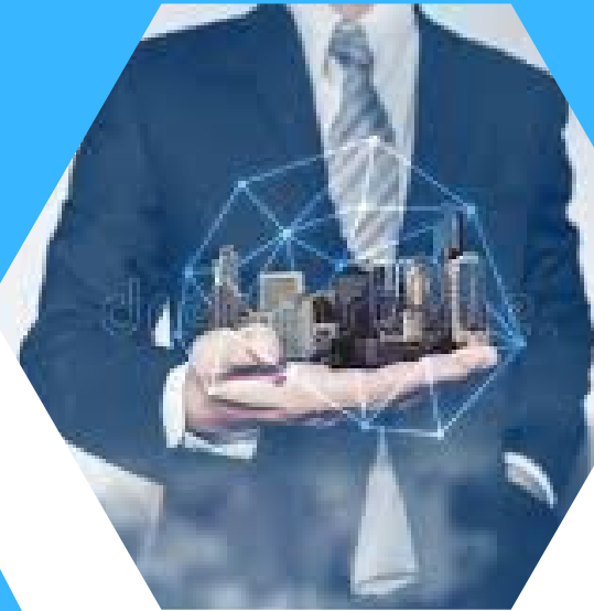
Real Estate Operation & Management